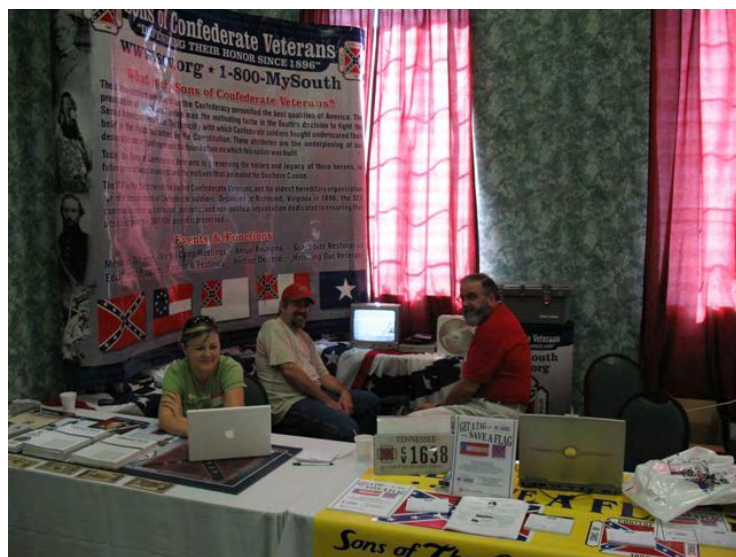
Left: A picture of the display area inside the convention center. Above: The TN Div recruiting and information booth.