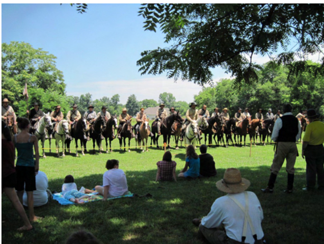
A couple of pictures from the Forrest Homecoming held at the Forrest Boyhood Home in Chapel Hill