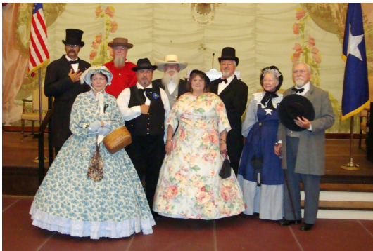
Left: Secession Day. Right: Decoration Day

On July 10, In Forrest Park, on Union Avenue, Memphis, TN, the N.B. Forrest Camp 215 hosted a celebration of General Forrest's birthday starting at 2:00 pm. The Memphis Brigade furnished watermelons, water and ice for the attendees of the event.