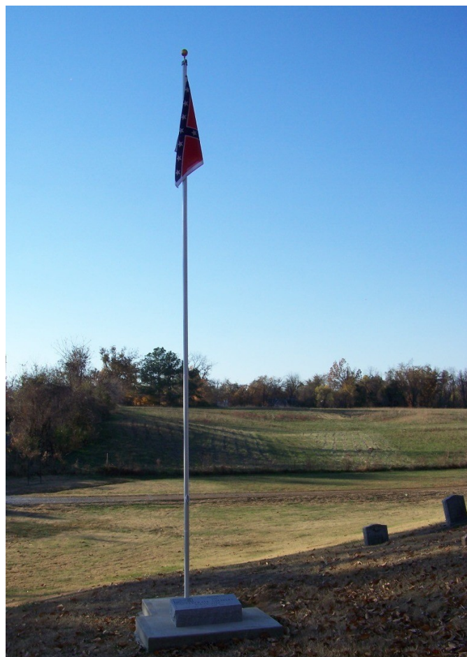
Hornbeak flag and monument